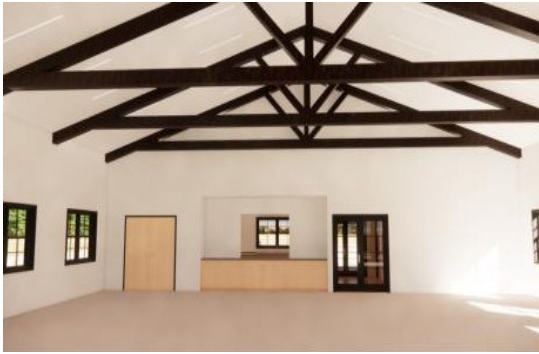
[ View Looking South ]